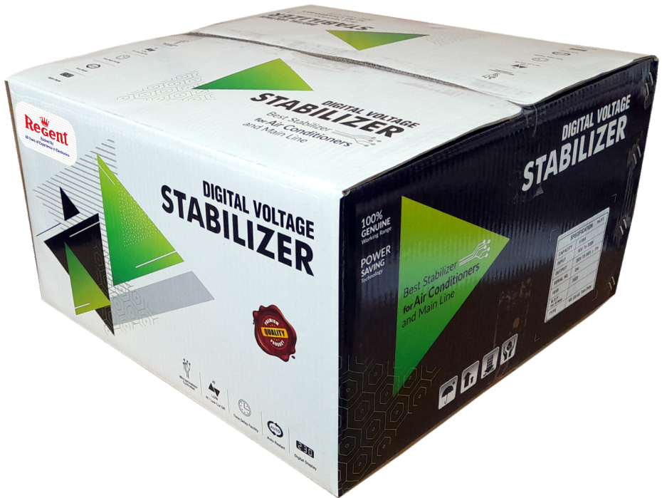
Packing Box of RE-5900 Master Carton Packing of 1 Pcs.